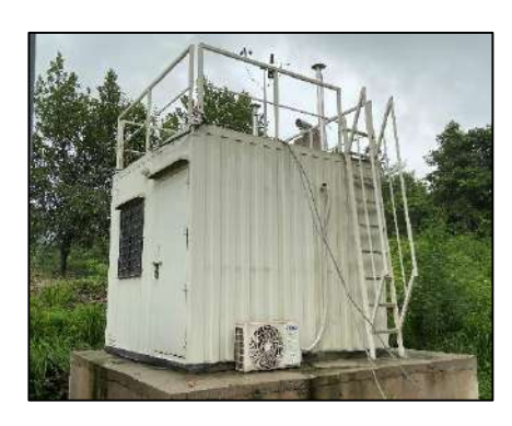
Continuous Ambient Air Quality Monitoring System