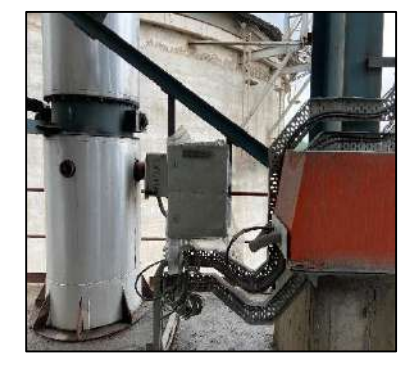
CEMS installed for the major stacks