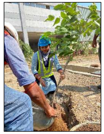
Fig 5. Plantation carried out on World Environment Day by JSW employees