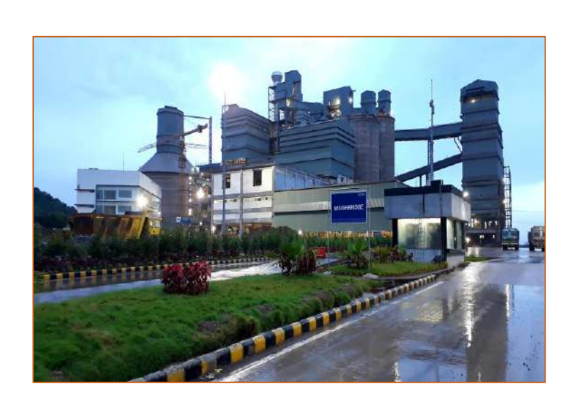
ENVIRONEMENTAL STATEMENT (FORM – V)