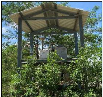
Permanent AAQ Stations