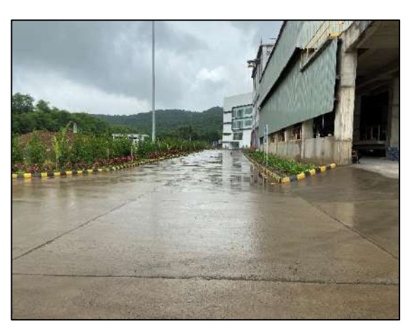
Fig 4. Green Belt Development inside the plant premises