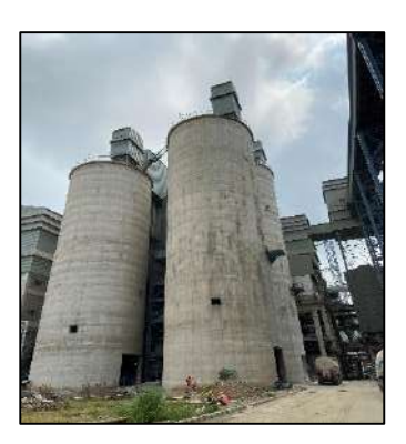
Closed silo for final products