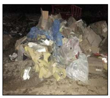
Fig 6. Plastic Waste Management Drive in collaboration with government bodies.