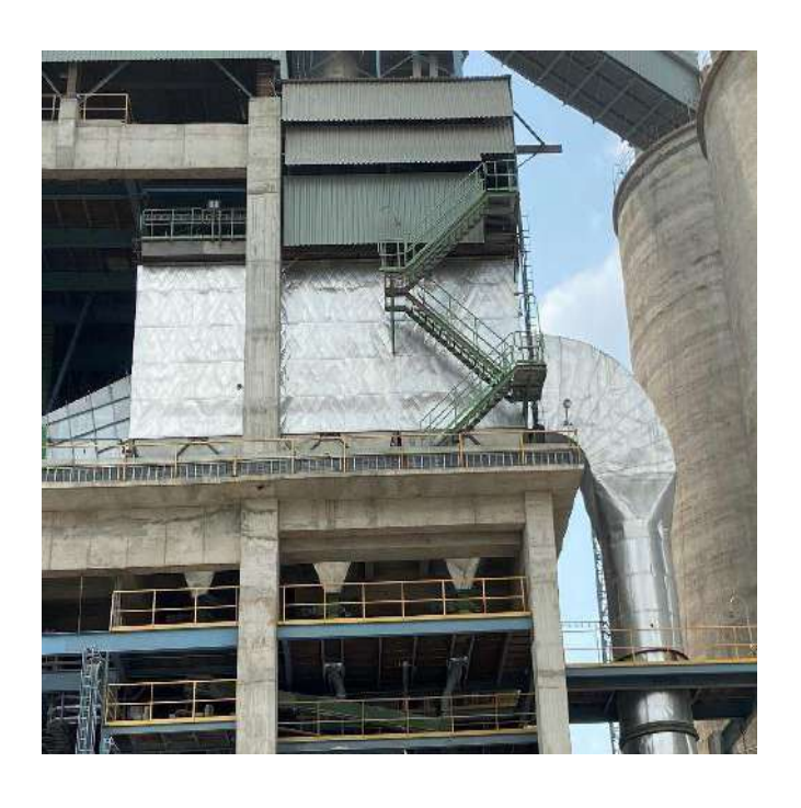
Main baghouse of the Roller Press