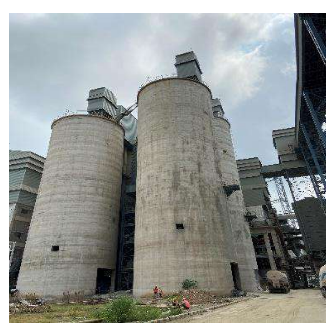
Closed Silo installed for Final Products