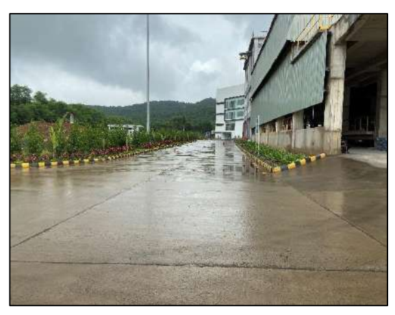
Fig 4. Green Belt Development inside the plant premises