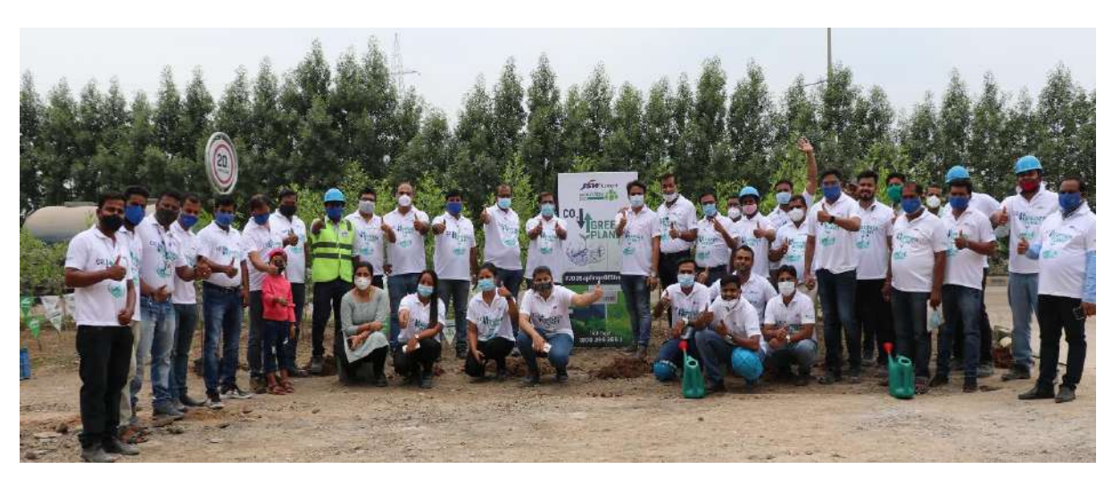
Fig 6. "World Ozone Day" and "Van Mahotsav" Celebration.