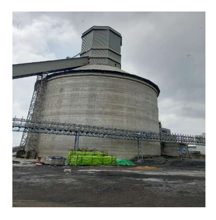
Clinker Storage Silo