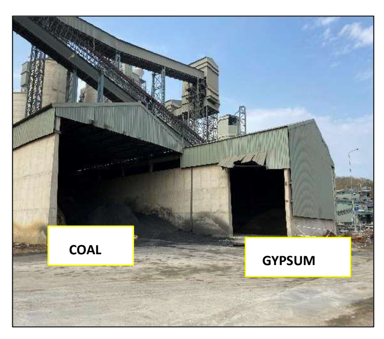
Coal and Gypsum Storage Yard